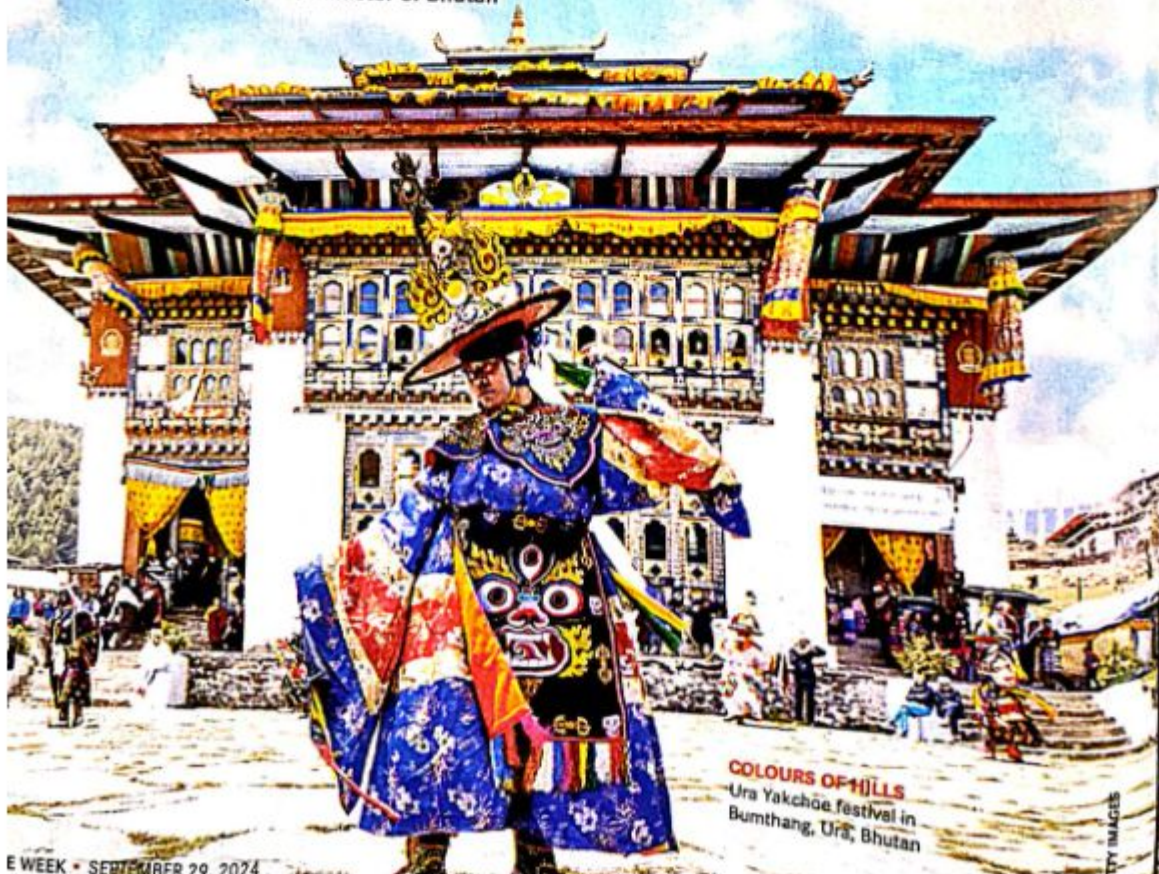
COLOURS OF HILLS Ura Yakchöe festival in Bumthang, Ura, Bhutan

India is not a controlling big brother, says Tshering Tobgay , prime minister of Bhutan GMC will have full executive, legislative and judicial autonomy, says Dr Lotay Tshering , former prime minister of Bhutan